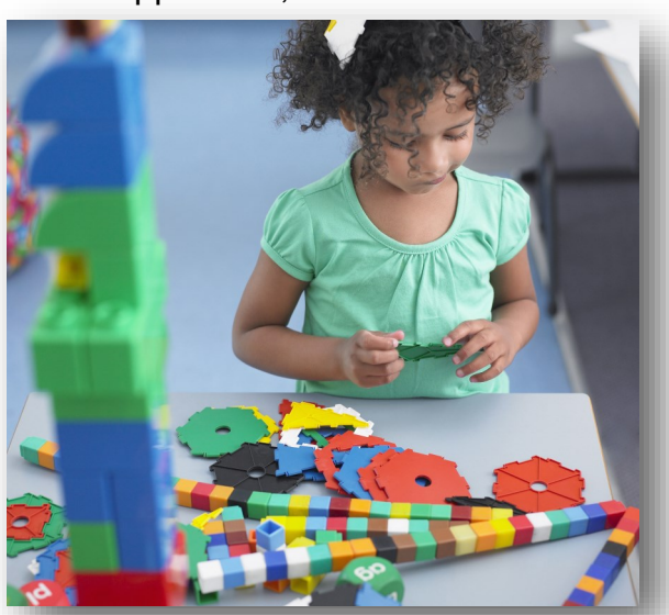
[Image Description: Elementary-aged femalepresenting student of Color in a classroom, using several different colored- and shaped- objects.]

offers multiple levels of support with the goal to dismantle barriers to learning for all students (Rose & Meyer, 2002). It moves the focus of instruction from correcting and remediating students' deficits, to interrogating the curriculum itself, searching for and dismantling barriers. Thus, UDL focuses on, rather than suppresses, students' differences.