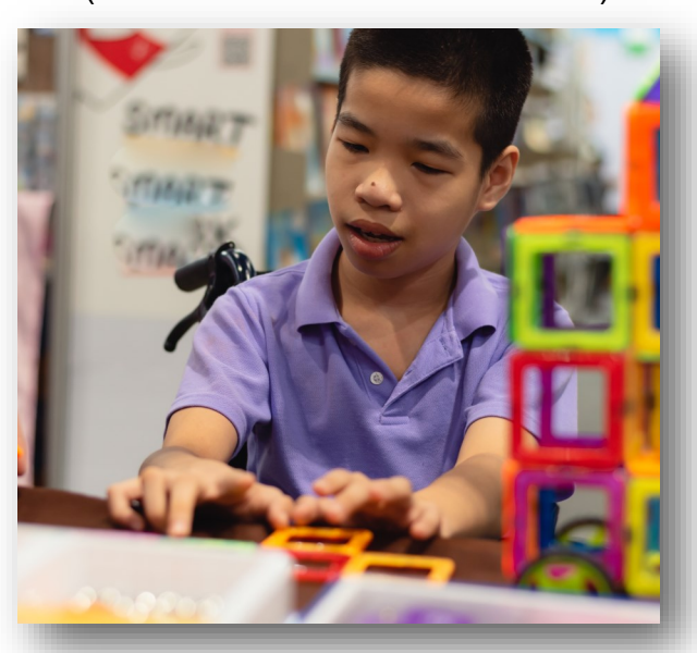
[Image Description: Male-presenting, middle schoolaged student of Color with a disability, sitting in a wheelchair doing classwork at a table.]

Yet, nurturing and sustaining youth identities needs to be accompanied by a critical reflexive stance. For instance. disability can not only be understood as cultures, but "culture as disability" (McDermott & Varenne, 1995, p. 324). This latter aspect of disability refers to institutional practices in which certain students are identified as disabled (McDermott & Varenne, 1995). Disabilities "are less the property of persons than they are moments in a cultural focus" (McDermott & Varenne, 1995, p. 324). That is, schools produce disability through institutional practices (such as academic and disciplinary policies and practices) and tools (such as academic assessments) that