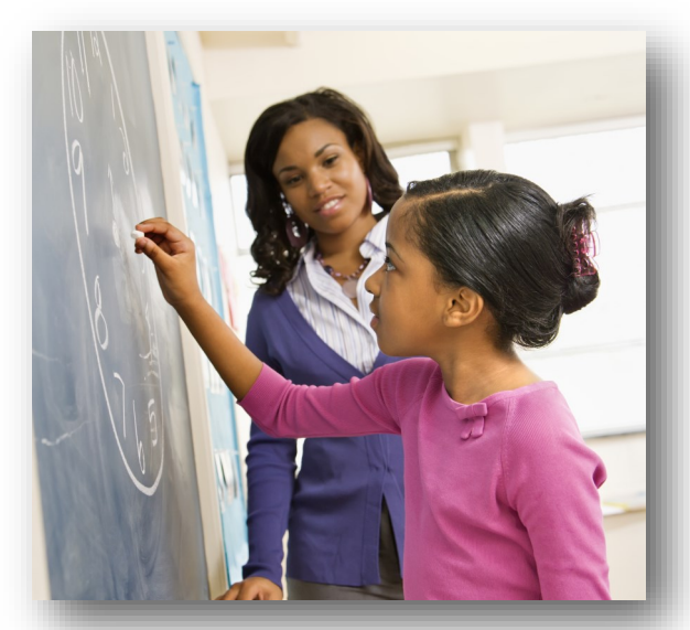
[Image Description: Black, female-presenting teacher looking on, as female-presenting, middle school-aged student of Color does work on a chalkboard.]

Bal et al.'s (2018) model of CRPBIS establishes practices and procedures for university researchers, administrators, teachers, alumni, and parents to examine and change disciplinary practices. CRPBIS creates "reciprocal and productive familyschool-community coalitions as a solution for building positive, supportive, effective, and adaptive school wide behavioral support systems" (Bal, 2018, p. 12). Consequentially, CRPBIS changes the power dynamics from the hierarchical model that dominates school decisions and serves as a catalyst to generate and implement new disciplinary practices that are sensitive to the cultures of families and students. Further, in a CRPBIS model, school stakeholders move beyond examining superficial outcome disparities to focus on the process in which those outcomes are deeply rooted and creates an ongoing learning space for teachers, administrators, families, and students (Bal et al., 2018).