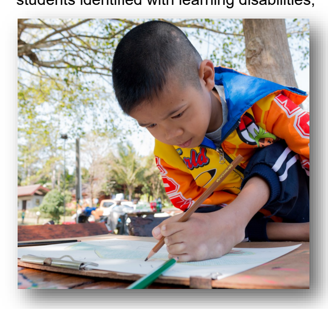
[Image Description: Male-presenting, elementaryaged student of Color sitting outside, holding a pencil between his toes, writing on a piece of paper clipped to a board]

school day in the general education classroom has increased over time, from 42% in 2002, to 63.5% in 2017 (U.S. Department of Education, 2019). There was also a significant decrease in the percentage of students with disabilities spending less than 40% of the school day in the general education classroom, from 29% in 2002, to 13% in 2011 (U.S. Department of Education, 2019). Yet, there are significant disparities in inclusion rates across disability categories. Students whose need and strengths allow them to be included in the general education classroom with only minor accommodations and modifications are much more likely to be included in such settings than those who require more substantive transformation of the general education practices (Kurth, Morningstar, & Kozleski, 2015). As of 2017, for instance, 87% of students identified a with speech or language impairment, 72% of students identified with learning disabilities,