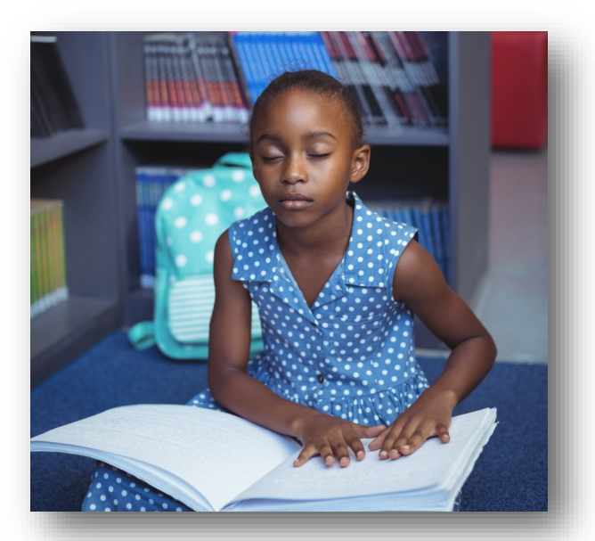
[Image Description: Black female-presenting, elementary-aged student in a library reading braille.]

national-level study on patterns of inclusion for students with disabilities in the general education classroom, Leroy and Kulik (2004) concluded, "inclusive education is White, middle class, suburban phenomenon for students with sensory and/ or physical disabilities. Conversely, a non-White student with a cognitive impairment living in a poor urban district has little chance of accessing inclusive education" (p. 16). These inequities have remained consistent over time and have been documented in both traditional and charter schools (Waitoller & Maggin, 2018) and at both the state and district levels (e.g., de Valenzuela, Copeland, Qi, & Park, 2006; Skiba, Ploni-Staudiner, Gallini, Simmons, & Feggins-Azziz, 2006; Sullivan, 2011).