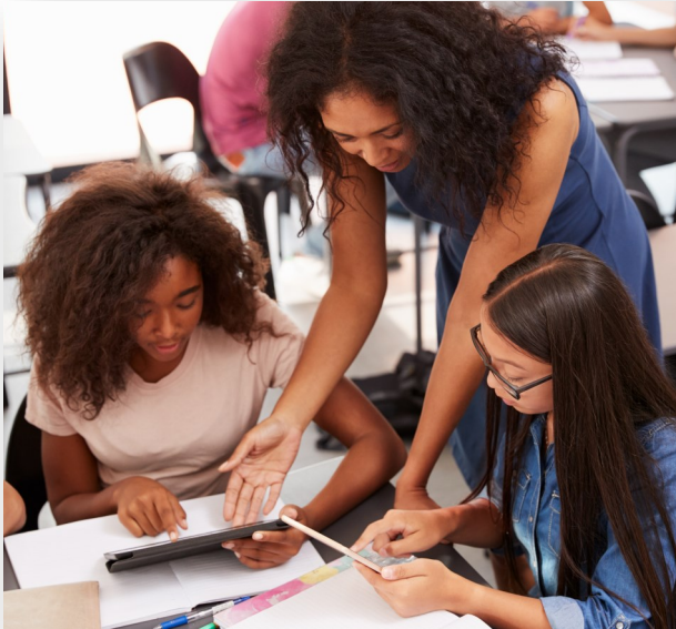
[Image description: A female teacher of Color leaning over two female students of Color as they read off of tablets and notebooks.]

participate civically, and problem solve or their own behalf—then we can ask whether our reading classes (and other classes) move toward that goal or away from it. Taking into account all of these dynamics may seem both complicated and abstract.