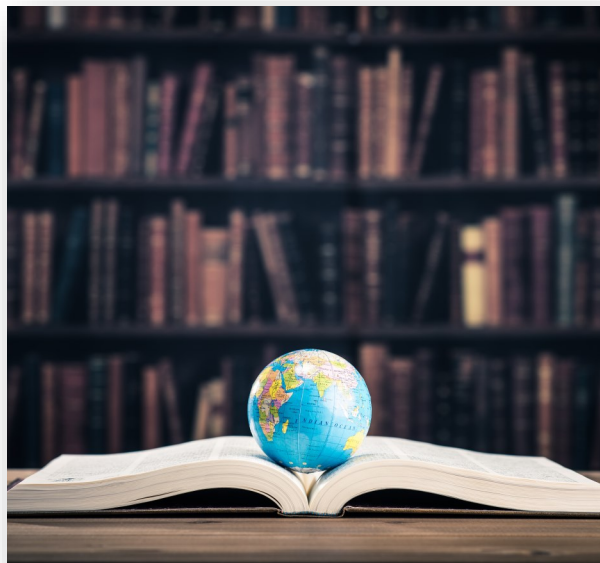
[Image description: Picture of an open book with a globe resting on top in front of shelves of books.]

exposed to since kindergarten. They have likely already learned the process, for example, of ‘how to state a prediction using support from the text’ by the time they reach the secondary grades. That’s not what they are missing. Instead, they experience the reading material provided as outdated and disengaging. These methods do not meet most individual students’ needs and as a result, we rely on “feeding the seals” to encourage and engage students with a curriculum that does little to improve missing literacy skills and even less to attend to why we teach reading in schools anyway (i.e., so that students use that capacity to gather ideas, consider information, and negotiate the world across their lifespans).