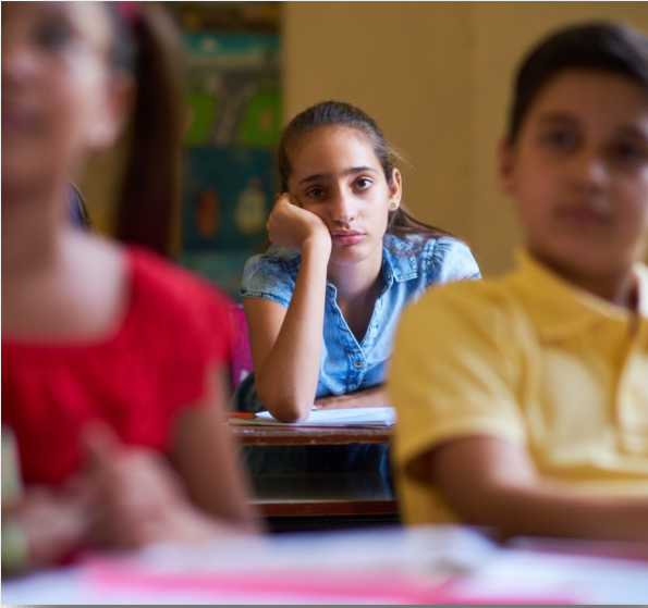
[Image description: Three students who appear to have brown skin and dark hair. Two in front listening, one in back with chin on palm looking bored or frustrated.]

Richardson, “Sometimes you need to scorch everything to the ground and start over. After the burning the soil is richer, and new things can grow.” My advice here is not to start a fire, but to think about your students enrolled in remedial reading intervention courses in middle school. Do they feel burnt or scorched? Do they trust you or themselves to think that their skills as readers (and more broadly as students) can grow? What challenges do you face teaching reading at the middle level? What do you enjoy the most? How you can provide more equitable and engaging schooling experiences for students?