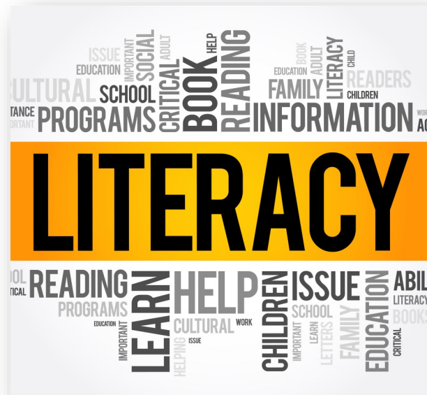
[Image description: Word cloud including text that describes literacy]

Using a critical literacy lens (Shor 1999; Street, 2003) we can see students' skepticism, disinterest, and/or anger as forms of resistance, however inchoate that resistance may sometimes be. Yet critical literacy pertains not just diagnostically, but also in terms of our ostensible goals for schooling, including reading instruction. In Shor's words, "critical literacy is language use that questions the social construction of the self. When we are critically literate, we examine our ongoing development, to reveal the subjective positions from which we make