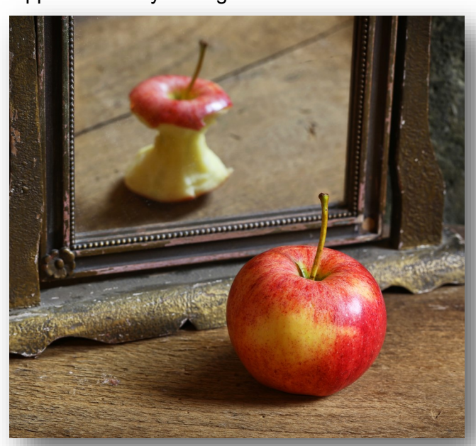
Attribution: [Photo of a whole apple sitting on a surface in front of a mirror. The apple's reflection is mostly eaten.]

But Sophia was not a passive recipient of microaggressions. She defended her dignity and her abilities ("Yeah, I don't know how to spell it"..."Sorry if am too slow at reading, at like spelling things") when receiving disability microaggressions from her peers and siblings. Microaggressions clearly have a heavy emotional load and Sophia's responses were equally charged with emotional energy. In the preceding example, she used the intensifier too as a form of amplification regarding her reading speed, as opposed to only stating she was "slow at