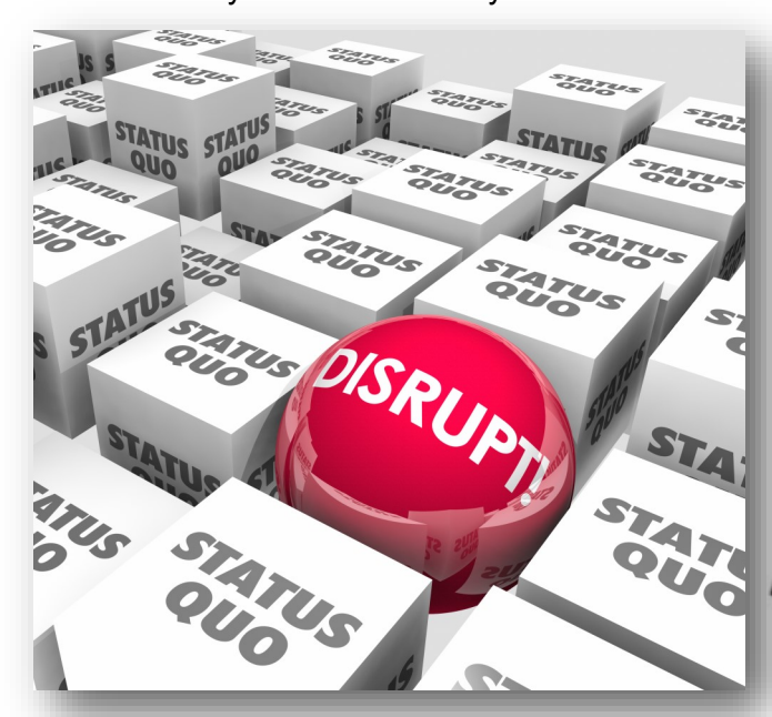
Attribution: [Graphic of white cubes of various heights with the word "status quo" on them. Centered is a red sphere with the word "disrupt!" on it.]

marginalized youth with LD at their intersections are of grave importance. This is vital for not only individual development but for changes within educational systems and society. There has