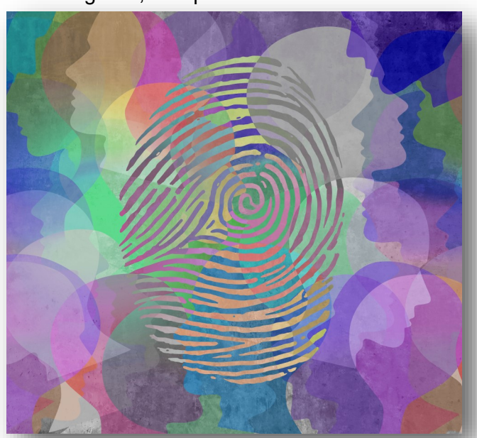
Attribution: [Illustration of a fingerprint centered in the foreground, with several overlapping, different colored faces, positioned in opposite directions, in the background.]

One key assumption in the LD field is that emotional and social impairments are exclusively located "in the individual." On the contrary, the distinctive characteristics of children and youth with LDs are emotionally, socially, culturally, and historically shaped (Hernandez-Saca, 2017). Therefore, it is important to document the perspectives and experiences of youth and adults with LDs. Some scholars suggest that students with LDs creatively navigate multiple social and emotional worlds in addition to disability, such as class, race, and gender (Connor, 2008; Ferri & Connor, 2010). Missing in this work is an exploration of affect, emotionality, intersectionality and the role of socio-cultural historical developmental perspectives for the lives of students with LD at their intersections of power and identities. Research must highlight these neglects, with particular attention to the