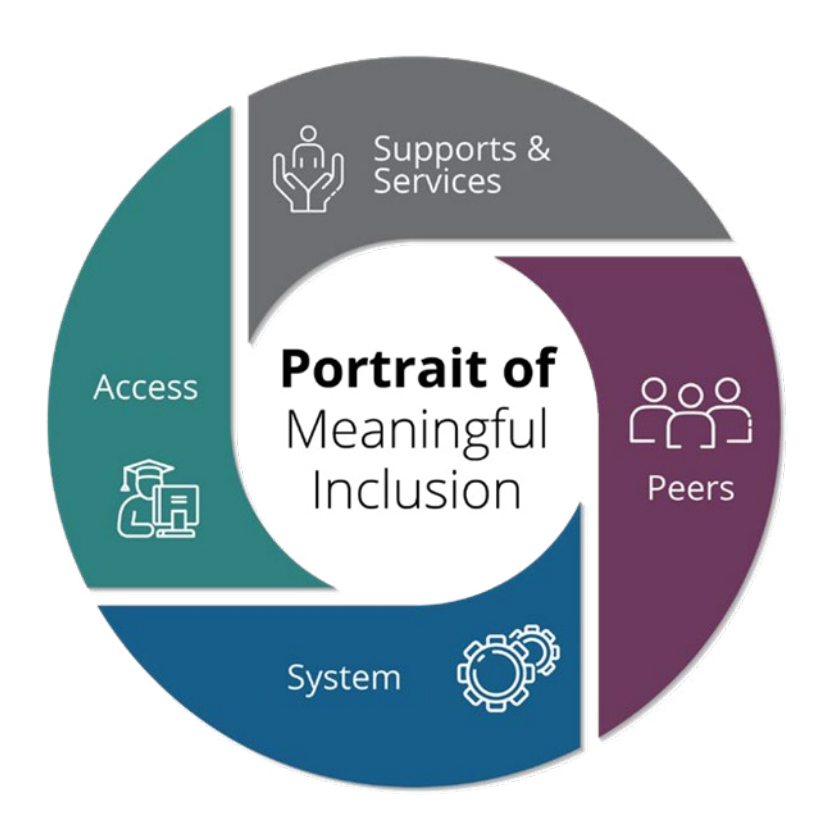
Figure 1: Portrait of Meaningful Inclusion Elements