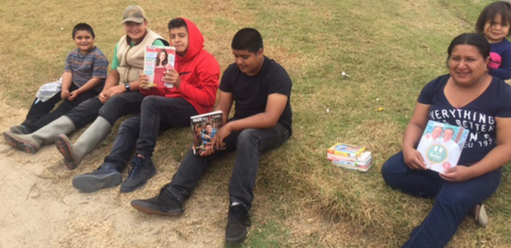
ABOVE: Marin's Reading on the Ranches brings summer reading to agricultural areas.