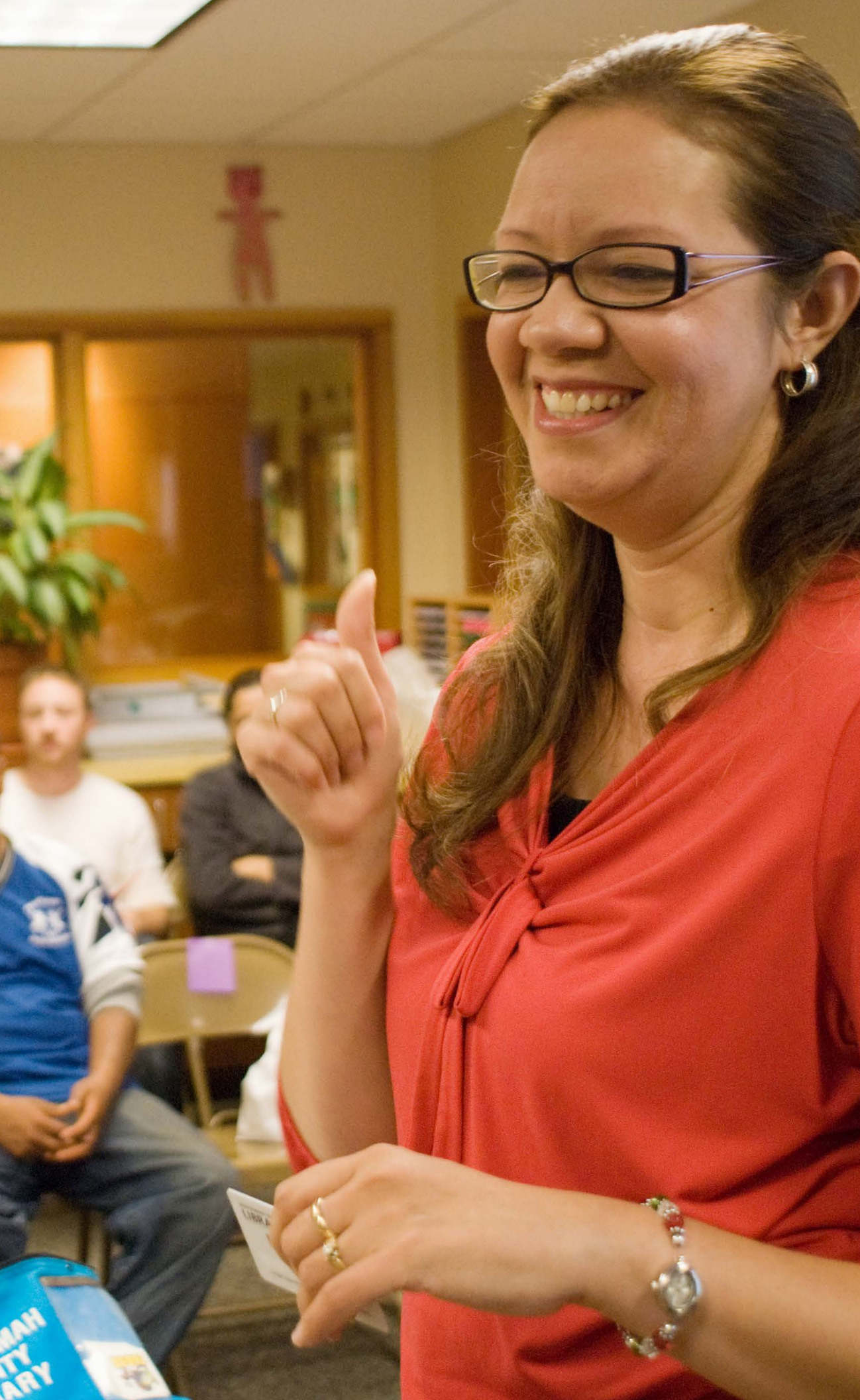
LEFT: Multnomah's We Speak Your Language staff connect linguistically diverse communities to the library.