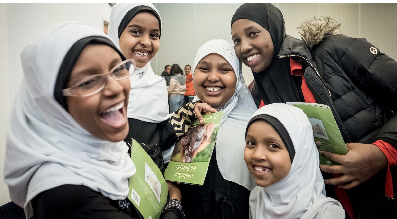
BELOW: Community members celebrate the release of "Teach Me To Love," a children's book Saint Paul Public Library had translated into the Oromo language.

SPPL's implementation of the GARE framework has strengthened the city, the library, its leaders and its staff. As noted above, the library's Racial Equity Action Plan and tracking tools are particularly strong. Using an annual workplan and quarterly dashboard, the library director and leadership team, along with the Equity Team define clear outcomes, specific action steps and clear staff expectations to produce measurable results.