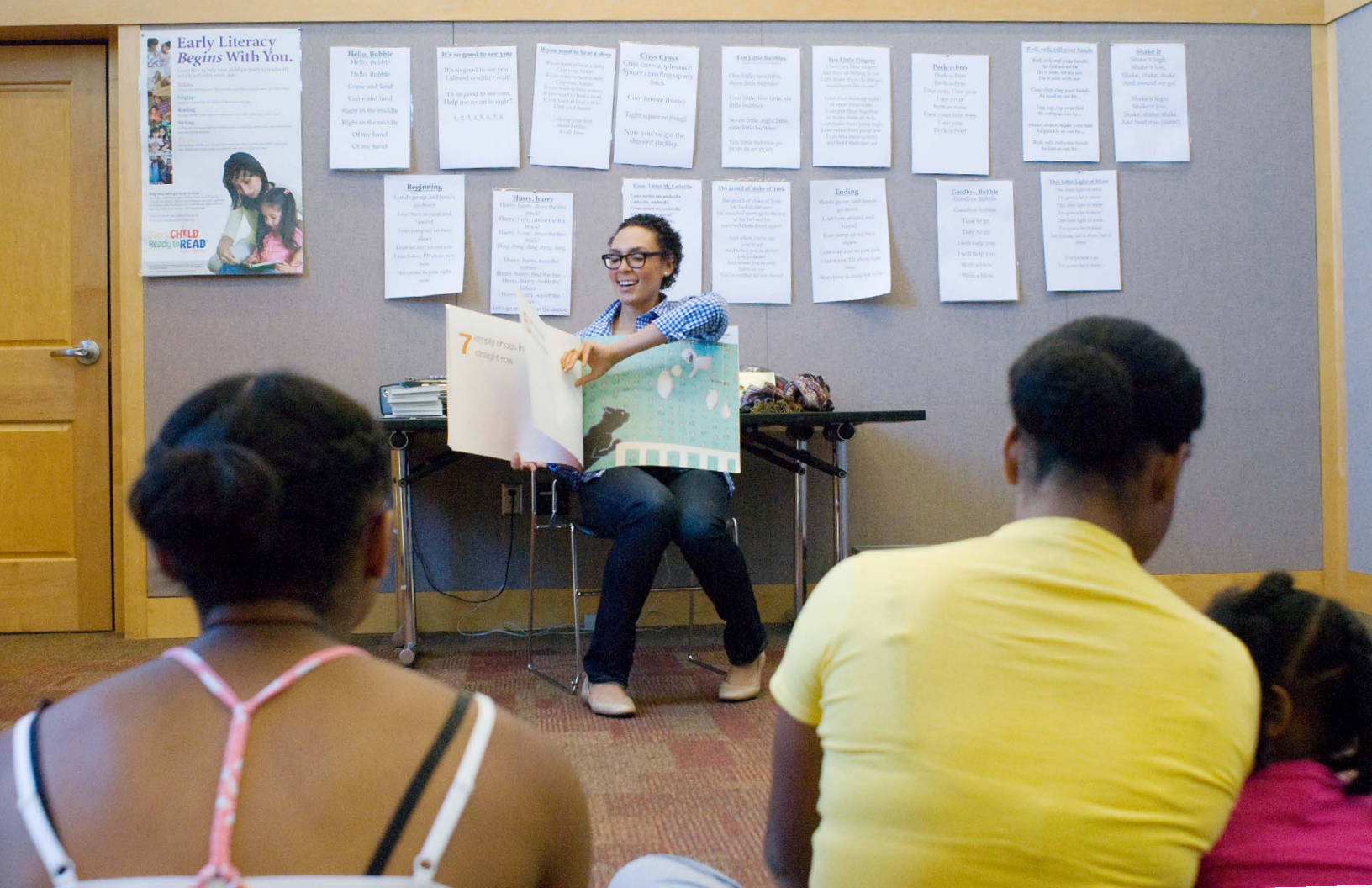
ABOVE: Multnomah's weekly Black Story-time celebrates literacy and African American experience.