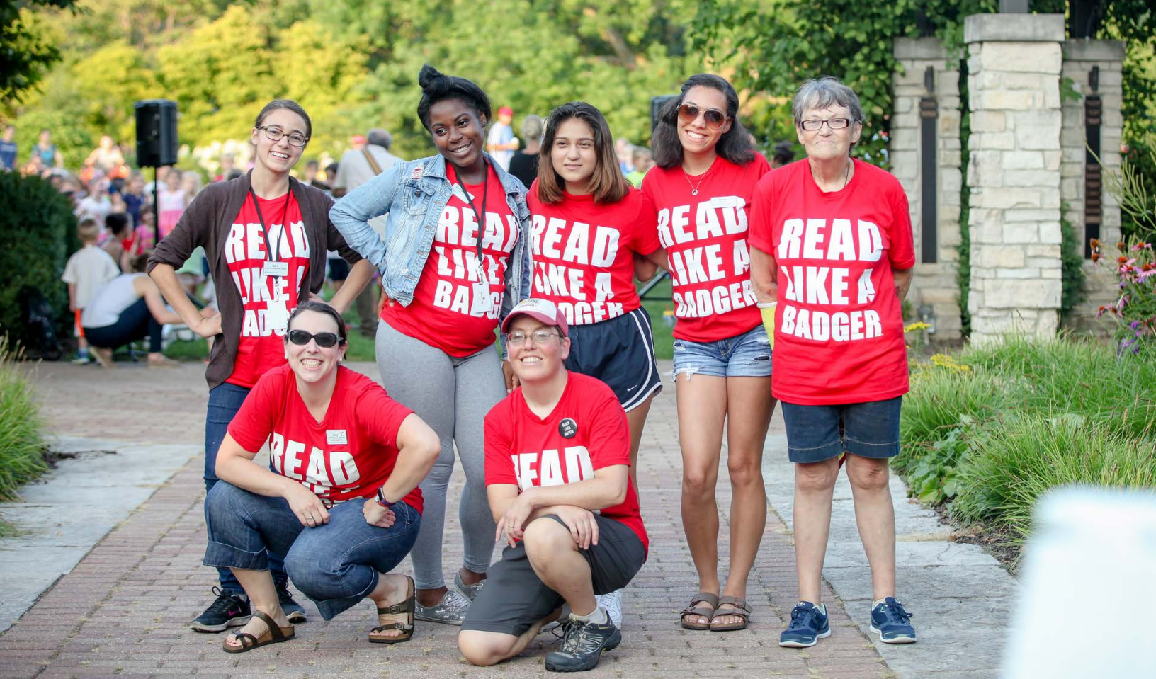
ABOVE: Madison's Wanda Fullmore Youth Internship promotes youth leadership and a pipeline to library jobs.