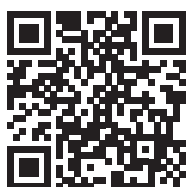
CIRCLE Activity Collection: Family

To access each page, open the camera app on your smartphone and point it towards the QR code. Click the notification that appears to open the page.