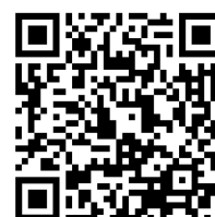
CIRCLE STEM Lab