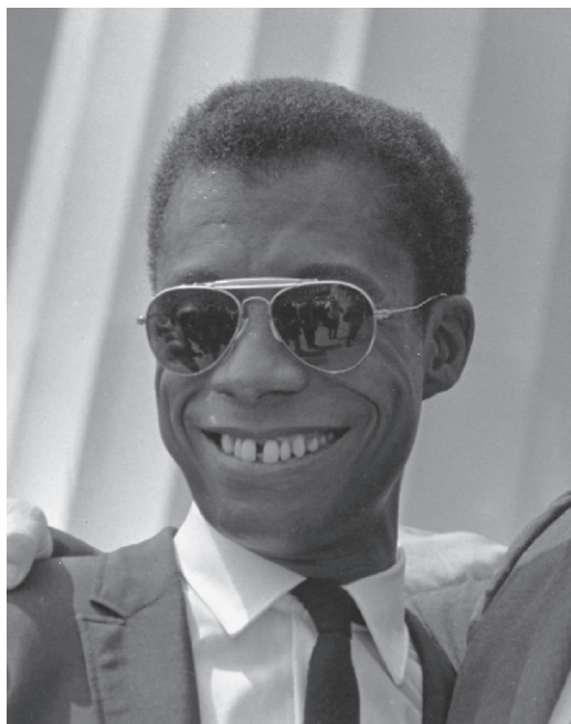
James Baldwin at the 1963 March on Washington for Jobs and Freedom

tolerance.org/classroom-resources/lessons