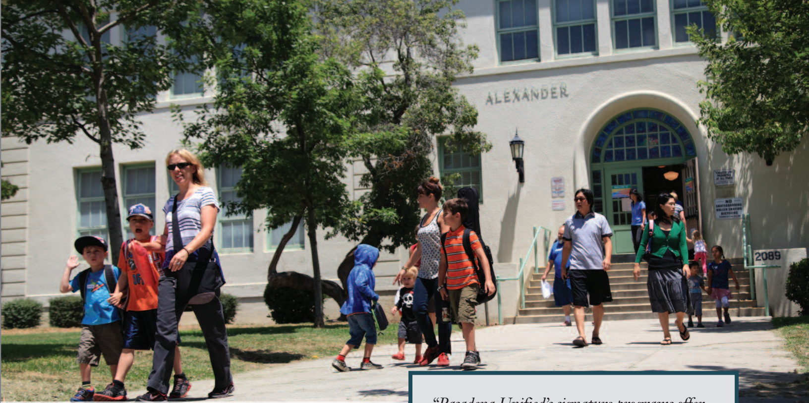
PUSD families attending Hamilton Elementary School

PUSD is only capturing approximately 55% of the school age population residing within its boundaries. The result is a student population that does not reflect the communities it serves.