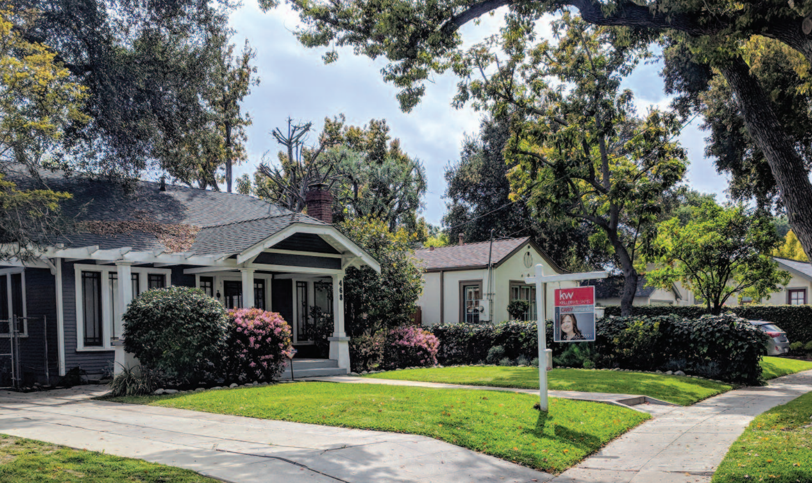
Home for sale in Pasadena, CA