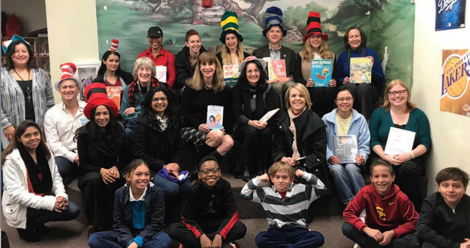
Realtors, civic leaders, school staff and students participating in Realtors Read Across PASadena on Dr. Seuss Read Across America Day at Don Benito Fundamental School.

residents and families to area schools. It's important to ensure that realtors are equipped with facts and personal knowledge of Pasadena Unified schools."